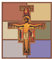
DIOCESAN PASTORAL COUNCIL