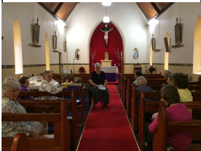
(Josephite group gathered at St Malachy's Rylstone)