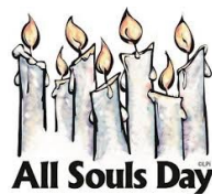
All Souls Day