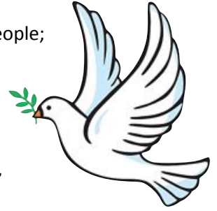
Used with permission One Licence A-641587

You are a light on the hill, O people; Light for the City of God! Shine so holy and bright, O people; Shine for the Kingdom of God!