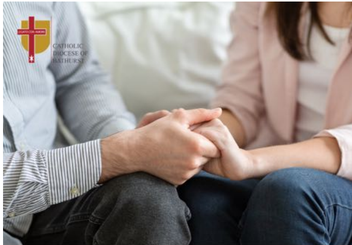
2 October 2022 - Blessing for Married Couples

God, our Father, We are brothers and sisters in Jesus your Son, One family, in the Spirit of your love. Bless us with the joy of love. Make us patient and kind, gentle and generous, welcoming to those in need. Help us to live your forgiveness and peace. Protect all couples and families with your loving care, Increase their faith, Strengthen their hope, Keep them safe in your love, Make them always grateful for the gift of life that they share. And May almighty God Bless you all, the Father, and the Son and the Holy Spirit. Amen